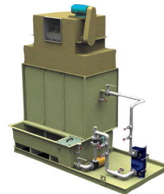
Liquid desiccant packaged conditioner

Alfa Laval Kathabar Phone +1 716-875-2000 Email: sales.kathabar@alfalaval.com Web: www.kathabar.com