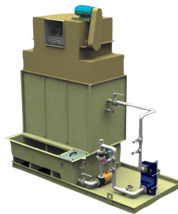
Liquid desiccant packaged conditioner

Alfa Laval Kathabar Phone +1 716-875-2000 Email: sales.kathabar@alfalaval.com Web: www.kathabar.com